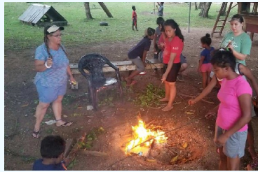
Their focus was on having Bible studies in small groups, addressing relationships with God, others and discussing normal life issues. We're grateful for all the gifts and clothes they brought, the new soccer goals, the fun evening roasting marshmallows and much more!