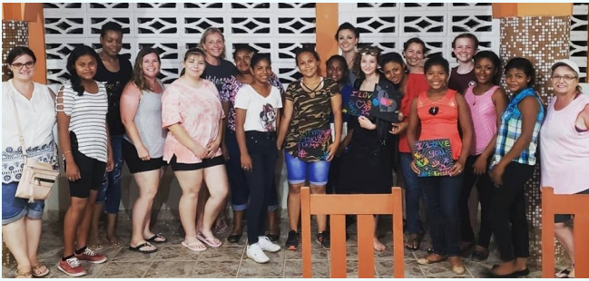
The Heights' Church team designed their visit to flow at a more casual pace, choosing to spend more time making memories.