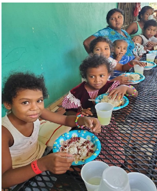
Always showing the love of Jesus, this team's hands on approach to feed those who are hungry and to exam and medically address minor physical needs of the sick, has had a positive impact for so many people. They minister their compassionate aid, not only to those under the umbrella of the Mama Tara Ministry, but to the community at large.