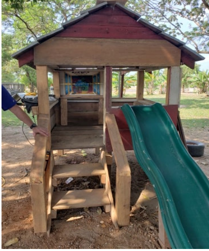
The old playhouse was renovated