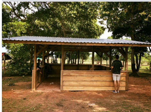
Built a covered cooking space to be used temporarily as the old kitchen is torn down and a new one is built some time next year.

This Fall team from Bethel UMC, Midland, N.C. came in like a whirlwind. They had a short window in time to do their projects and look what they did in 5 days. It's amazing what teamwork can accomplish! (The photos are only a small sample of their accomplishments)